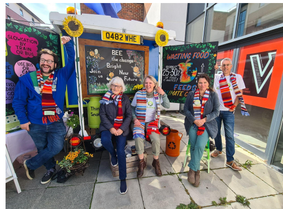
Green Living team with their Eco Float Horsham, Sussex

It was first launched in 2021 by The Climate Coalition to demonstrate the fantastic efforts happening in support of action on climate and nature loss in villages, towns and cities in every corner of the UK. Since then it has gone from strength to strength. Hundreds of thousands of people from all walks of life take part each year, and thousands of events are organised.